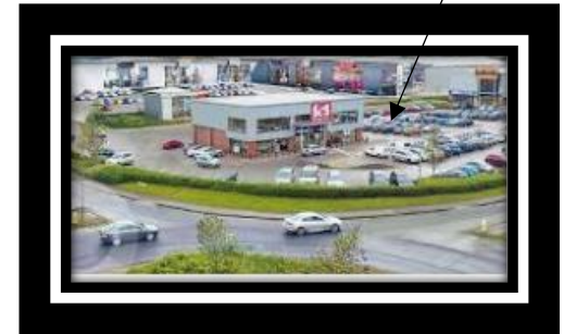
Aerial view of Cortonwood