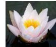
Lotus Flower Symbolises purity, it grows from the mud to become beautiful.