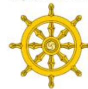
Dharma Wheel Symbolises the belief of birth, death and re-birth.