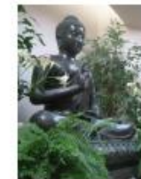
Buddha Symbolises an ordinary man who became holy.